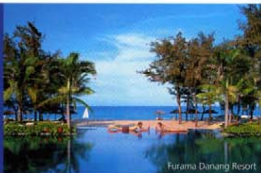
Furama Danang Resort

■ Sandy Beach Resort (255 Huyen Tran Cong Chua Street, tel: +84 (511) 836 216, www.sandybeachdanang.com.vn ) For something less corporate and more informal, this four-star hotel located south on Non Nuoc Beach is a friendly, peaceful alternative. Practically in the shadow of Marble Mountains, the low-key beach resort – owned by the Australian Norfolk Group – offers spacious and comfortable beach or garden bungalows, or wing rooms in the main building (from USD98 or SGD158), among 16 hectares of private gardens dotted with pines.