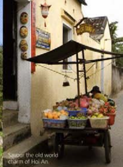
Savour the old world charm of Hoi An.

Chams around AD192), which covered Vietnam's Central Provinces. Most of the 300 or so terracotta and sandstone figures here were excavated and collected from the region and date from the 7 th to the 15 th century.