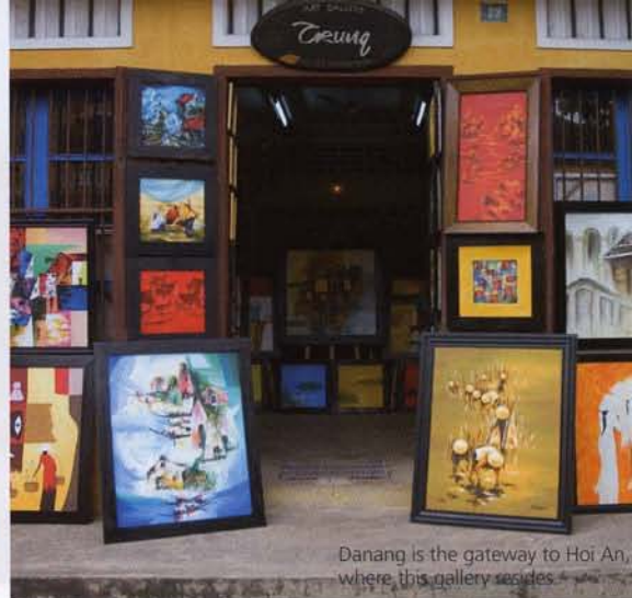
Danang is the gateway to Hoi An, where this gallery resides.