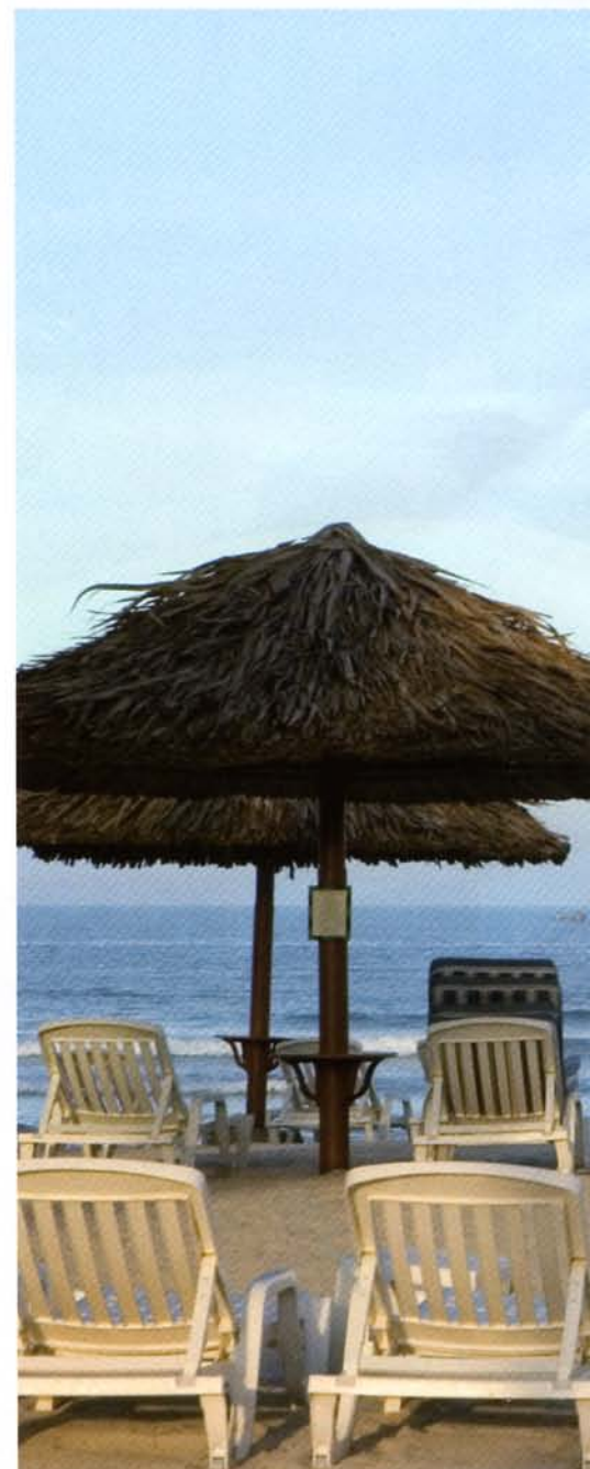
China Beach is on Forbes magazine's list of the world's most luxurious beaches.

Danang was the former capital of the ancient Champa civilisation (founded by the