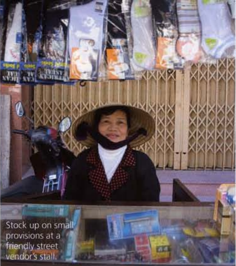
Stock up on small provisions at a friendly street vendor's stall.